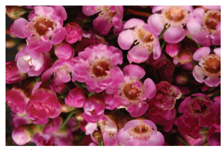
Chamelaucium Strawberry Surprise