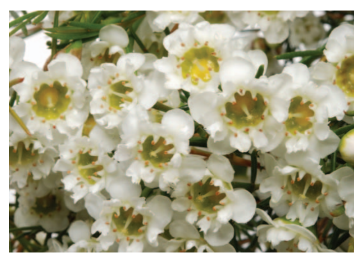
Chamelaucium Chantilly Lace

WAFEX also has a commercialisation agreement with a state based authority in Victoria for the marketing of an exciting range of new Leptospermum hybrids. The Leptospermum genus also has