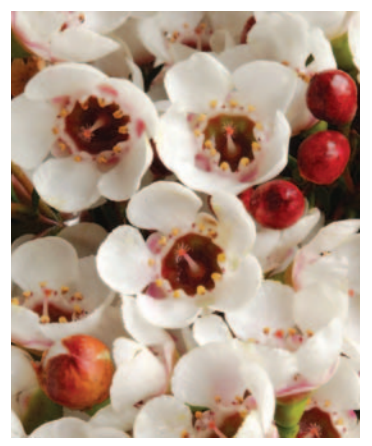
Chamelaucium Moonlight Delight

HELIX AUSTRALIA SEEKS EXPRESSION OF INTEREST FROM AGENTS, GROWERS OR DISTRIBUTORS TO MARKET THE EXCITING RANGE OF WAXFLOWER VARIETIES THROUGHOUT THE NURSERY AND LANDSCAPE MARKETS OF THE MIDDLE FAST.