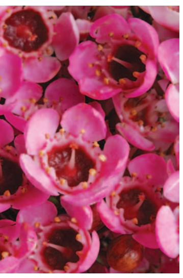
Chamelaucium Sarahs Delight

displaying an attractive bi colour appearance with both white and red flowers and everything in between.