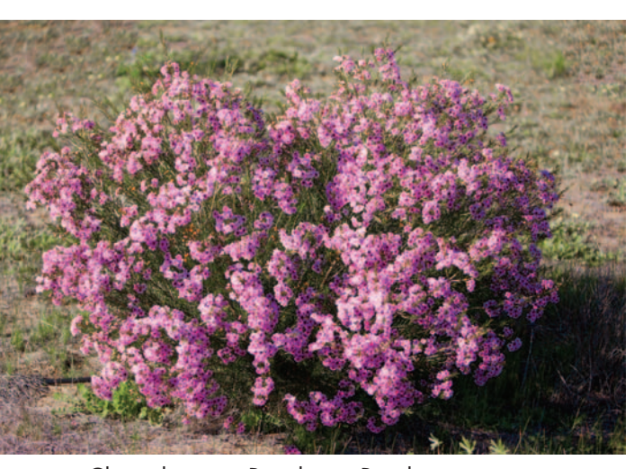
Chamelaucium Raspberry Ripple

displaying an attractive bi colour appearance with both white and red flowers and everything in between.