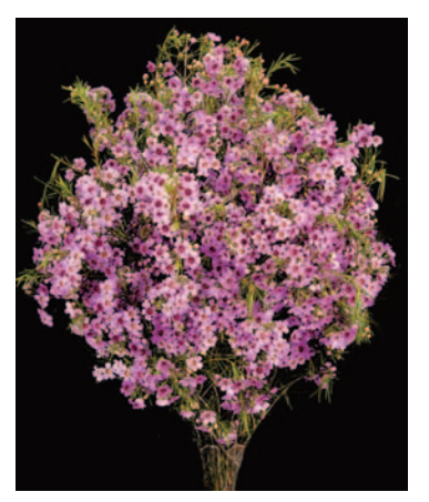
Chamelaucium Raspberry Ripple

Unique frilly edge white blooms with very attractive lime