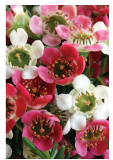
Chamelaucium My Sweet 16

From early spring, masses of pure white flowers open, then mature to a rich red shade