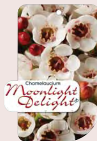
Moonlight Delight label