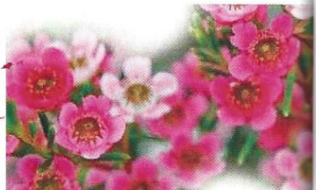
My Sweet 16